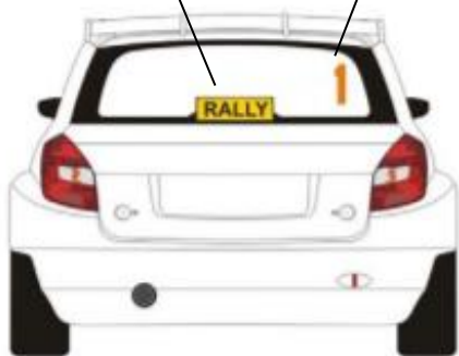
Competition Number Orange (14cm high)