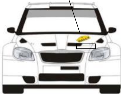
Front Plate & Competition Number (43 x 21.5cm)